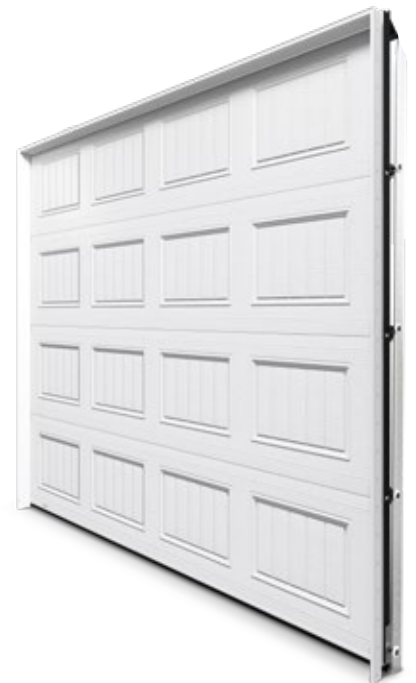
INSULATION R=16 GAREX Illustrated door: 1 3/4" (R-16) door